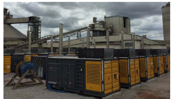
Mining/Construction (PRP) Support