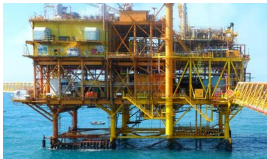
O&G/Marine (PRP-Peak Shaving) Mobility (Dim. & weight)