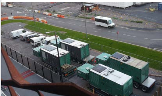
Events (PRP – Redundancy) Low noise